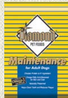
50 - lbs. DPF111

Specially designed to give active, athletic dogs the nutritional support they need to stay in peak physical condition at work or play. Formulated with a precise balance of high-quality protein and fat to promote the building of healthy muscle tissue and to give extra energy to maintain stamina.