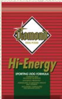
Hi-Energy Formula 50 - lbs. DPF442

Diamond® Pet Foods, a privately held, family-owned enterprise, was founded in 1970 as a livestock feed company.