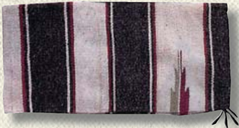
30" x 60" Navajo blanket. 206463 $15.95