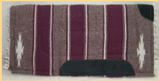
30" x 30" Navajo top and synthetic-bottom saddle pad. Assorted colors.