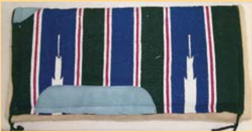
30" x 30" Navajo top and fleece-bottom saddle pad. Assorted colors. 206383 $27.95