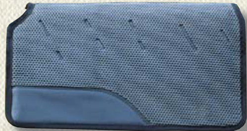
All pads are made of antimicrobial foam and are slip-resistant. Easier on your horse than conventional pads. Fungus and mildew resistant. 1" thick 2-ply material. 34" x 30"

201014 black, 1" $46.95 201015 brown, 1" $46.95