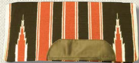
1-inch Tacky Tack Pad with Navajo top. Bottom is antimicrobial foam and is slip-resistant. Assorted colors, 30" x 30".