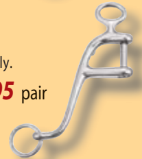
6" shank only. 155136 $17.95 pair