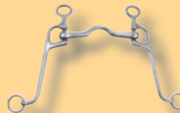
Bit for walking horses. 5" mouth with 8 1/2" shank. 155128 $26.95