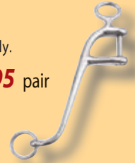
8" shank only. 155135 $18.95 pair